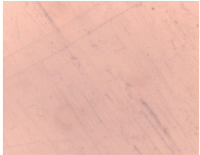
AvaDent Patented Puck Process